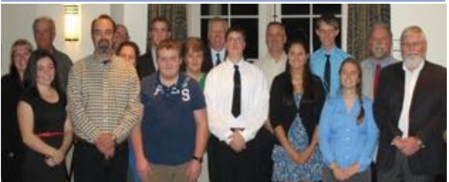
The Northeast Division of Tappi/Pima met at the Buchannan Alumnae House on the UMaine campus for their fall Scholarship Banquet. $1000 scholarship awards were presented to one student from Maine Maritime Academy, two students from Kennebec Valley Technical College, and three students from the University of Maine.

The program brochure will be posted on our website in January, 2013