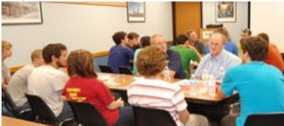
Consider Engineering participants enjoy lunch and questions of engineers at Sappi in Skowhegan as part of the mill tour offered each week of the program.

Consider Engineering has been offered for over 40 years and has introduced more than 4,000 students to UMaine and engineering and is the best recruitment tool we utilize to encourage students to consider our industry.