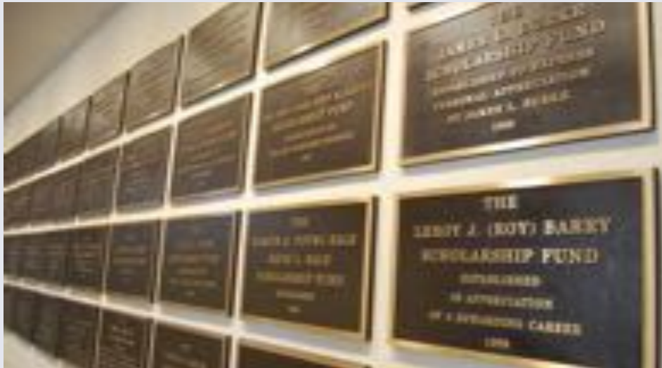
Named Scholarship plaques displayed in the Foundation's Hall of Appreciation.