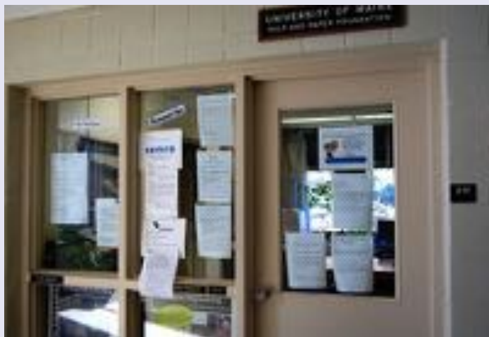
The glass wall of the Foundation's office entrance has posted on it a wide array of employment opportunity announcements for seniors.

The month of October was very busy with many companies visiting the University of Maine Campus to attend the annual Engineering Fair and to interview seniors for permanent hire positions once they graduate in May.